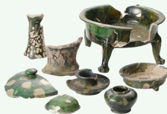
Sansai pottery excavated from the ruins of Kamiodera Temple, Kyoto Prefecture (Important Cultural Property)

Approximately 8,000 excavation surveys are carried out every year across Japan. This exhibition will focus on excavated items from archaeological sites across the country that have attracted particular attention in recent surveys. In addition, the results of recent surveys of archaeological sites in the Minamiyamashiro region from the Nara period will be introduced.