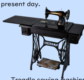
Treadle sewing machine