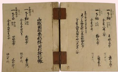
Kabatamura Land Survey Record (Furukawa Family Documents))

This exhibition will showcase a carefully selected collection of materials collected in recent years that convey the history and culture of the southern Yamashiro region in particular.