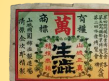
Persimmon tannin product label

*The permanent exhibition will be closed from Saturday, September 6th to Sunday, October 5th, 2025 due to the special exhibition "Excavated Japanese Archipelago 2025."