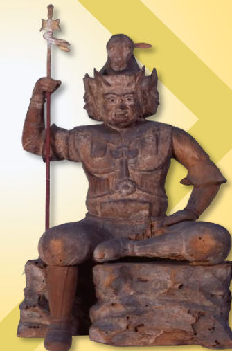
Statue of Gozu Tenno at Matsuo Shrine in Kizugawa City