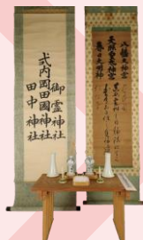
Kizu 3-chome Himachi-ko materials