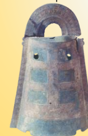
Bronze bell unearthed at the Saganakayama site in Kizugawa City